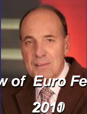
Fellow of Euro Fed Lipid